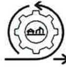
Municipal Corporate Transition