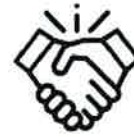
Relationship Building and Dispute Resolution

The Targeted Sector Support (TSS) Initiative is a cost-shared grant program that uses a portion of Municipal Revenue Sharing ($1.5 million per fiscal year) to support projects that strengthen municipalities' core operational capabilities through increased regional cooperation.